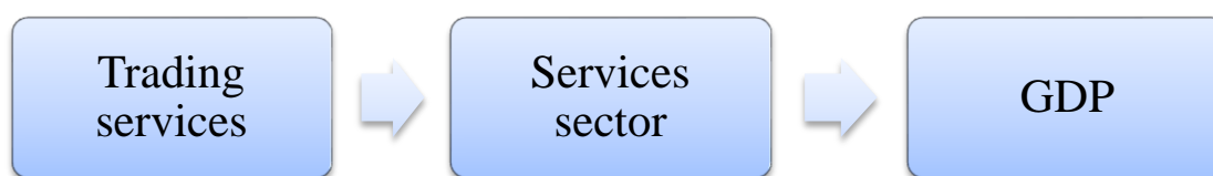
Figure 1. The role of trade services in the formation of GDP

Indicators such as GDP, services and trade services, reflecting the socio-economic development of the national economy in 2010-2021, were used to forecast trade services (Table 1).