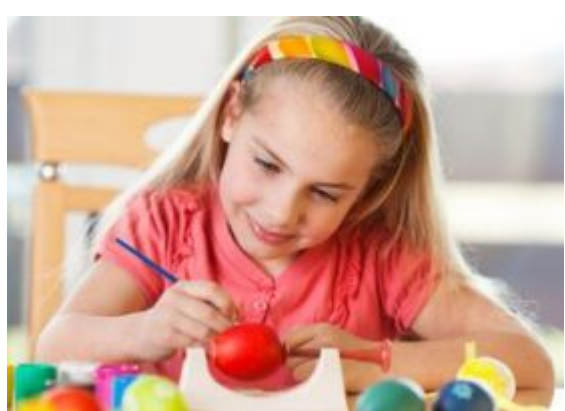
Developing children's creative abilities

All methods of development in the program should be visual, verbal and practical. Visual methods include viewing any drawing, drawing, or actual viewing. For example, when studying clouds, determine what they look like. Verbal methods include communication, stories, various forms of conversations. For example, the combined composition of fairy tales, in turn, makes judgment on a plot. Practical methods include creating games, creating and using different models, and performing developmental exercises. By combining all the methods, you can achieve a comprehensive development of the child, which will have a positive impact on your intellectual abilities.