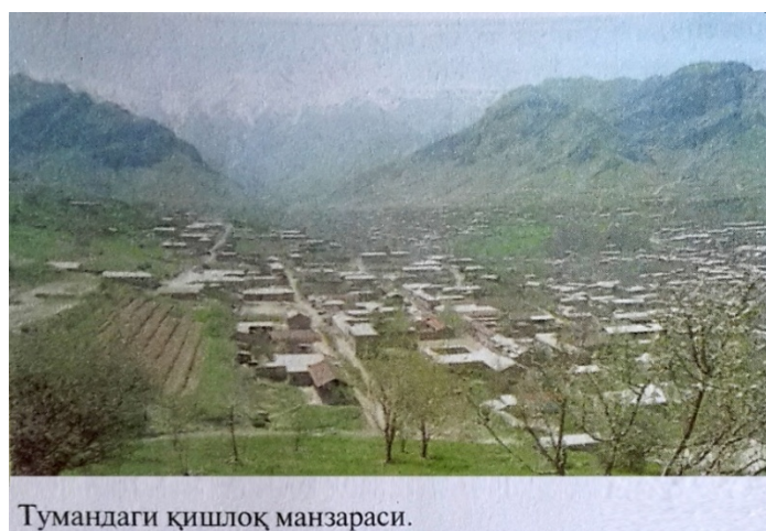
Тумандаги қишлоқ манзараси.

Urgut district is a district of Samarkand region. It was founded on September 29, 1926. Located in the southeastern part of the province. It is bordered by Bulungur district in the north-east by the Zarafshan river, Taylok in the north, Samarkand districts in the north-west and west, the Republic of Tajikistan in the east and Kashkadarya region in the south. The area is 1120.3 square kilometers. The population is 334.2 thousand people (2002). There is one city (URGUT) in the district, 12 Village Citizens' Meetings (Bahrin, Beshbulok, Jartepa, Ilonli, Spanish, Mirzakishlok, Pochvon, Uramas, Yangiarik, Koratepa, Gus, Hamza). The center is the city of Urgut.