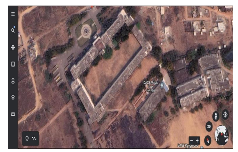
Figure 2: Dhaanish Ahmed College of Engineering, Chennai

Padappai is a town in the Kanchipuram district of Tamil Nadu. Because of its proximity to Oragadam Industrial Park, it has a high population density. Humidity and precipitation are common throughout the monsoon months of June, July, August, and September. During this time of year, this region experiences significant rainfall [46-51]. The months of October and November have mild temperatures and nice conditions. Because of its proximity to Padappai town, the campus of Dhaanish Ahmed College of Engineering experiences heavy rains during the monsoon season and a dry spell for much of the rest of the year. This causes a campus-wide water shortage in the summer, which can be remedied by collecting rainwater from roofs. College buildings that can be used as catchment areas include the Main Building (Block A), Main Building (Block B), the Four Boy's Hostel Buildings (Block A, B, C, and D), and the Masjid Buildings. Below is a photo of the majority of the Dhaanish Ahmed College of Engineering in Chennai, India, where students are learning about and developing rainwater harvesting systems. Dhaanish Ahmed College of Engineering can be found at the coordinates 12°52'24.0" North, 79°59'41.1" East. Vanchuvanchery, Padappai, Dhaanish Nagar, Chennai 601301. In Figure 2, we see how a GIS can be used to (GIS) [52-55].