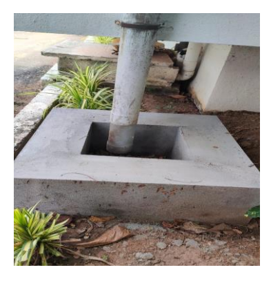
Figure 5: Vertical discharge pipe and discharge

volume of the Recharge Well considering the main building as the catchment area. There are 10 pits with a 5.3 m3 volume over the entire campus region (fig.5).