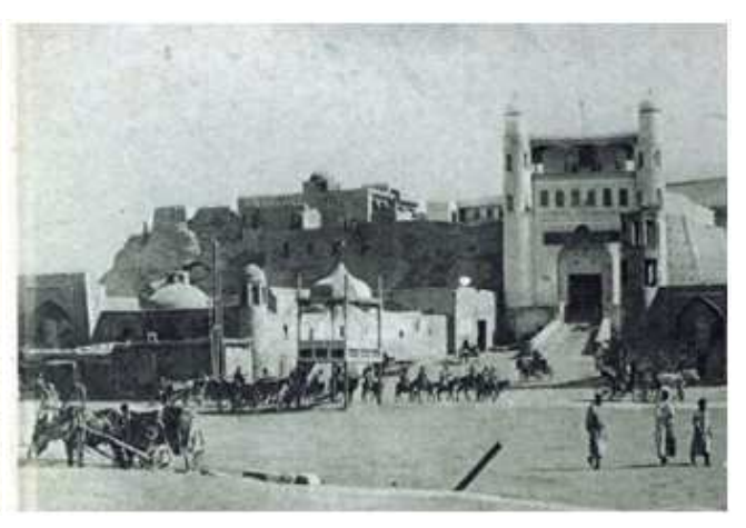
Dar ash-Shifa Madrasah