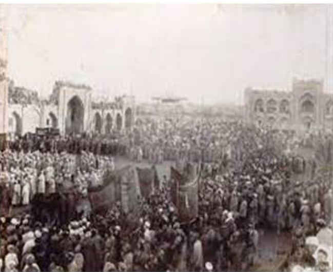
Bazari Gusfand Madrasah