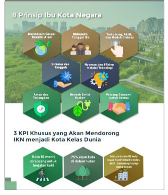
Figure 1. Principles of the National Capital (Source: Pocket Book of IKN Transfer in Indonesian).