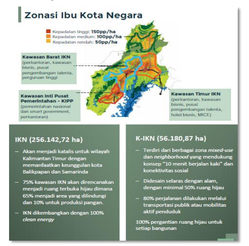
Figure 3. IKN zoning.

Minister of National Development and Planning or Head of BAPPENAS Bambang P.S. Brodjonegoro, the government has prepared a zoning plan for the IKN development. The plan is divided into four IKN areas (Fig 3).