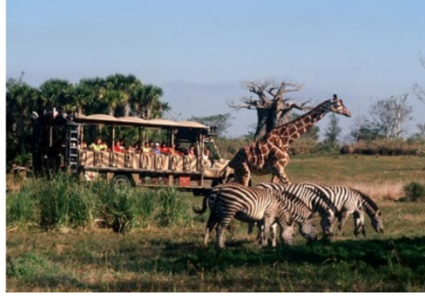
Animal Kingdom Zoo near Orlando, USA.

III. RESULTS AND DISCUSSION. Unlike the above examples, in Uzbekistan, where there are two state zoos (in Tashkent and Termez), apart from small zoos in separate parks in Samarkand and Tashkent, only the Tashkent Zoo [10] is the only large zoo in the republic. A feature of the territory of the zoo, with an area of 21.5 hectares, is its location between the Boz-Su and Salar canals. The planning principle is systematic. A collection of rare and endangered animal species is collected here, cultural, educational and research work is being carried out on the preservation, breeding and reintroduction of rare and valuable species of animals. Much attention is paid to the conservation and breeding of animal species in the Central Asian region. The Tashkent Zoo is a full member of the Euro-Asian Regional Association of Zoos and Aquariums - "EARAZA".