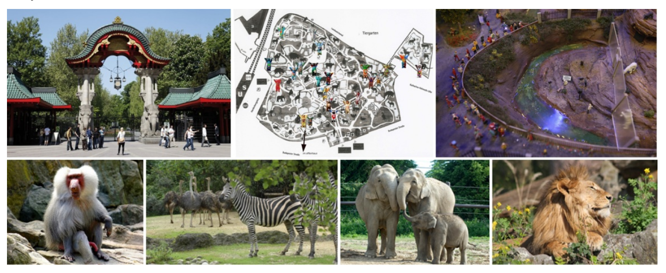
Entrance, scheme and enclosures of the Berlin zoo "Tiergarten".

interesting and varied. Along the enclosure of polar bears, there is a pond surrounded by rocky shores, which, reflecting in the water, create a wonderful dark background for light bears. The landscape character of the zoo is well combined with the free outlines of pedestrian and transport alleys and roads.