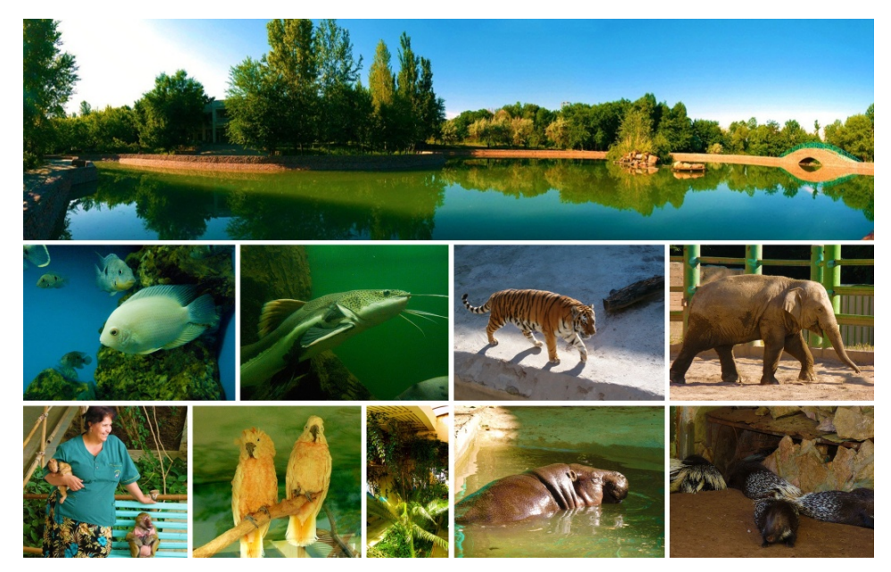
Panorama, fragments of the climatron and aviaries of the Tashkent zoo.

| e-ISSN: 2792-3983 | www.openaccessjournals.eu | Volume: 1 Issue: 6