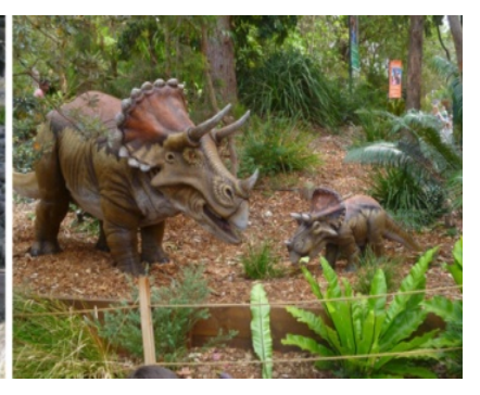
Park landscape overlooking the city of Sydney, a fragment of a monkey roll and an exposition of dinosaur sculptures at the Taronga Zoo in Australia.

Themed zones of domestic animals are organized in different zones of the zoo: "On the farm", "Pets", "Young animals' playground", "Horse breeds" and the exhibition "In the back yard". Based on the suggestions of visitors, family recreation corners are formed, accompanied by various educational programs.