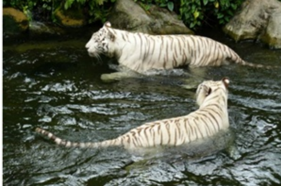
Aviaries of flamingos and white tigers at the Singapore Zoo.

It should be noted here that the first zoos with elements of "safari" became world famous on the territory of the Czech Zoo, where on an area of more than 100 hectares were formed areas of the "island", as close as possible to the natural living conditions of numerous African animals [3]. Similar conditions are called "The Animal Kingdom "was also created in the Disneyland theme park in Orlando, Florida, USA [9]. Here, many animals live in realistic safari-style environments where human presence is minimized in most of the space. The Animal Kingdom is home to over 1,500 exotic animals and hundreds of amazing collections of fish and birds. The park also has areas for games, entertainment and life-size displays of prehistoric animals.