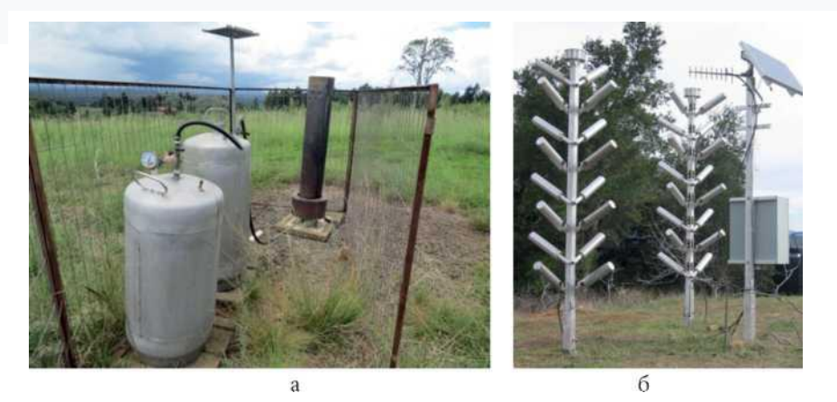
Figure 1 shows photographs of some of them.

Rice. 1. Ground-based acetone generator of the French company "ANELFA" (a), automated ground-based pyrotechnic generator "AHOGS" of the American company Ice Crystal Engineering (b)