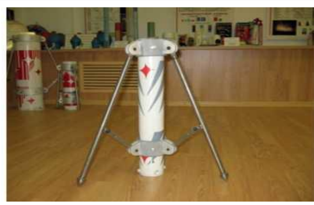
Rice. 5. Generator GLA-105